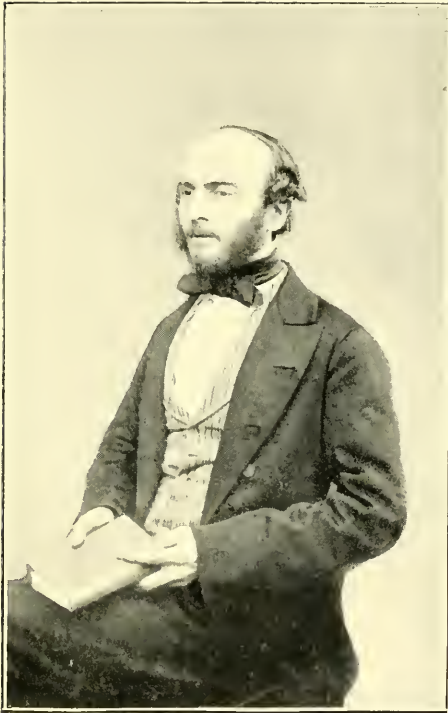
CHARLES BAGOT CAYLEY.